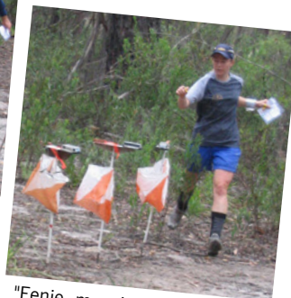
"Eenie, meenie, meinie, mo!"