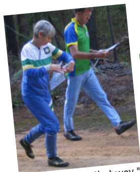
"I think north is that way." "Really!"