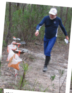
"I'll go for the middle one"