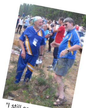
"I still say you made a bad route choice!"