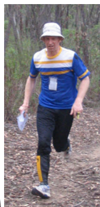
"It was the only hat I could find!"