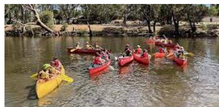
Canoeing on the Swan River