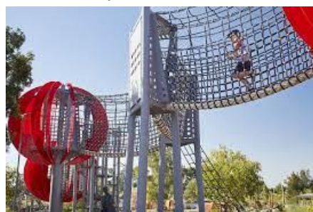
Chevron Adventure parkland