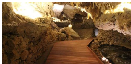
Yanchep National Park caves